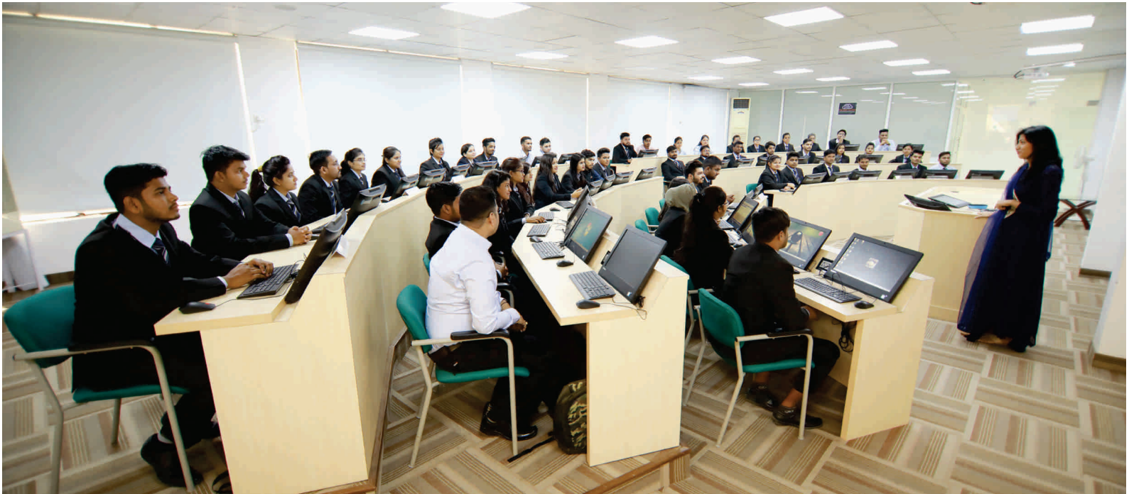
The programme is co-designed by LSC India & LLOYD keeping in view the fundamentals & practical knowledge required by the future managers to meet the demands of the Industry.