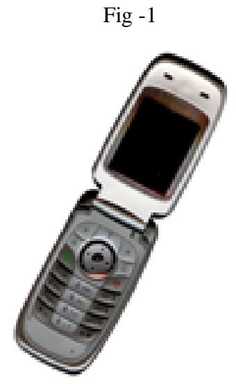
Fig. -1. Example of an unacceptable low-resolution image