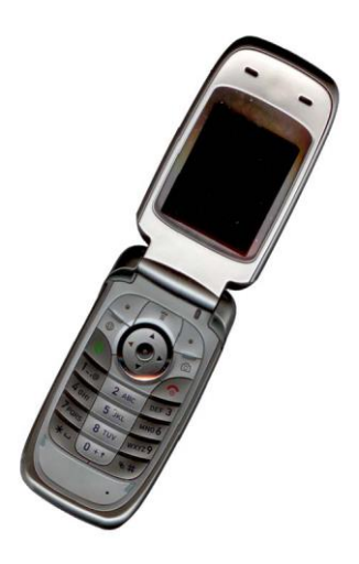
Fig. -2. Example of an image with acceptable resolution